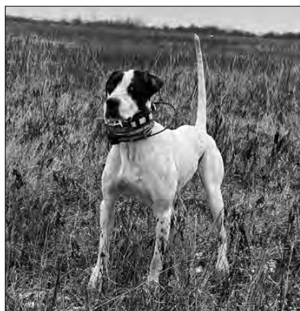
Alliwood's Eleventh Hour, Runner-up in the Region 13 Amateur Shooting Dog Championship

The winner had five evenly spaced finds, the first along Riverside Drive just entering the Old Apple orchard. This was a very tempting situation considering the inclement weather, which caused the birds to be less than enthusiastic to fly. The second was along the Christmas Tree fields just east of the Tibbets Creek crossing. Style and manners were exemplary. The handler showed confidence in his dog and