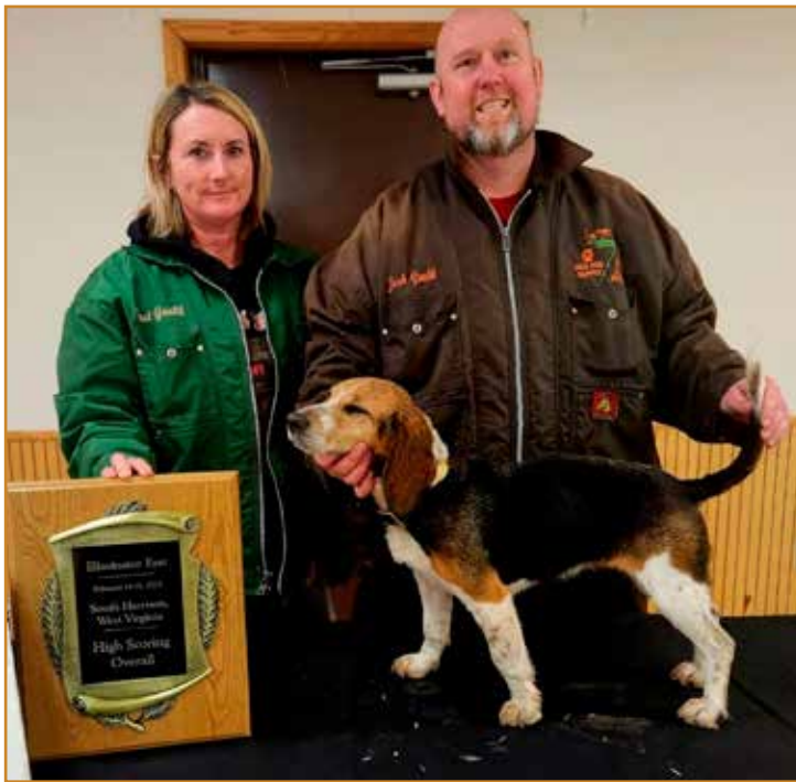
HBCH Grubb Farm Charlie's Lil Charlie