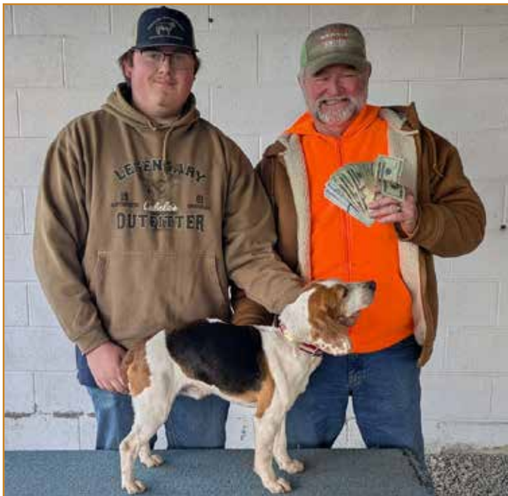
GRHBCH(2) Clifty Creeks Ball Pean 5M