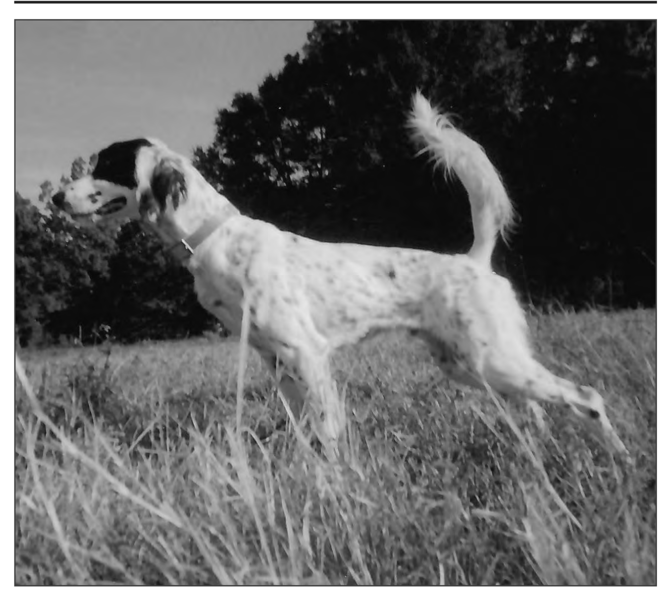
DOWNHILL RACER 4 placements

Using the best from the Past to breed the best of the Future .